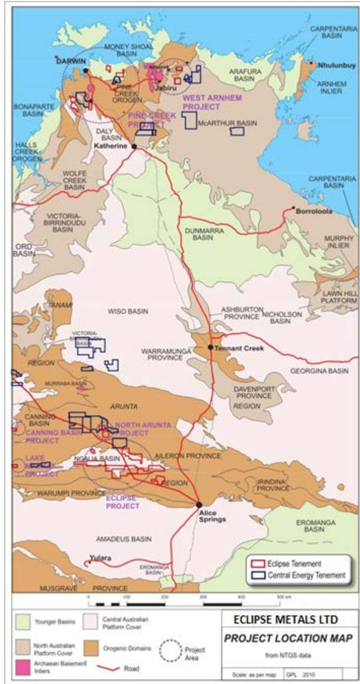
Figure 4. Eclipse Metals Limited- Project Areas